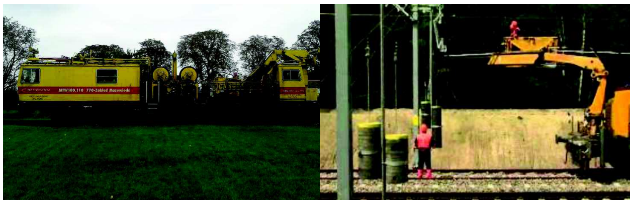
Fig. 1. Considered real railway vehicle

MTW 100 - a network emergency train manufactured by the Austrian company Plasser & Theurer, designed for repair and maintenance of the traction network was considered. Structure of the vehicle was presented in fig 1.