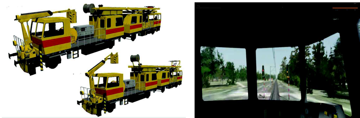
Fig. 2. View of model of the special train created in the Virtual Simulator (VBS3) and the cabin inside

VBS3 comes equipped with several built-in applications that support development training capabilities. These include the following: mission editors, which allow users to add, modify or delete objects before and during training, and an after-action review module, which allows administrators and users to conduct post-training analysis with the ability to fast-forward or rewind to events; a full development suite, allowing users to create buildings and railway line, edit terrains and convert 3D models to the VBS3 simulation environment; a massive content library, including more than 9,000 entities; an HLA/DIS gateway that connects VBS with other simulations or interconnects many VBS servers together. The Virtual Battlespace 3 (VBS3) is a flexible simulation training solution for multiplayer scenario training, mission rehearsal and more. The Virtual Battlespace (VBS3) to visualize the motion of the rail traffic was used (fig. 2).