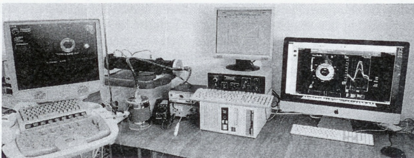
Fig.2. Setup for elastic properties measurements of the LV.

The setup for elastic properties measurements of the LV is presented in Fig. 2. It consists of the LV model immersed in cylindrical tank filled with water, the hydraulic pump, the ultrasound scanner, the hydraulic pump controller, the pressure measurement system of water inside the LV model and the iMac workstation. Results of the statistical analysis of dependence of measured elastic parameters of the ultrasound model of the LV for two positions of the ultrasound probe are given in the Table 1.